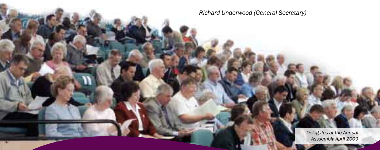
Delegates at the Annual Assembly April 2009