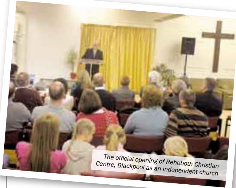
The official opening of Rehoboth Christian Centre, Blackpool as an independent church